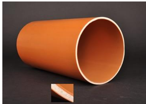
FIGURE 1 – SC PVC-U HD ELECTRICAL CONDUIT

Note: Australian Standards do not consider pipe manufacturer's reworked material to be recycled PVC.