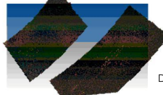
Dispersion in Humes 8" Pipe (x10)