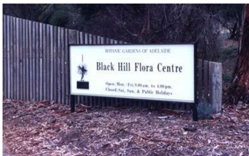
FIG.1 ENTRANCE TO BLACK HILL FLORA CENTRE