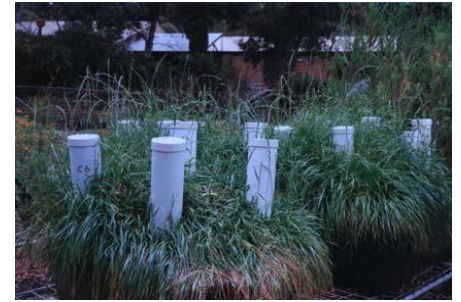
FIG. 5 ASSEMBLIES WITH ESTABLISHED RYE GRASS