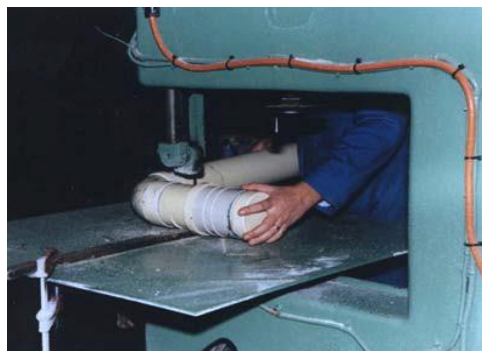
FIG. 10 CUTTING A PVC ASSEMBLY WITH A BANDSAW