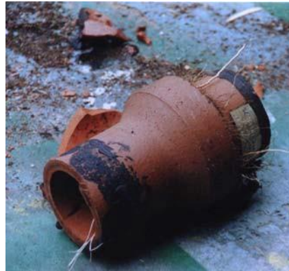
FIG. 13 VC ROLLING RING JOINT WITH ROOTS HAVING ENTERED PAST THE SEAL