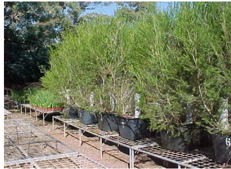
FIG. 7 ASSEMBLIES WITH ESTABLISHED MELALEUCA ARMILLARIS