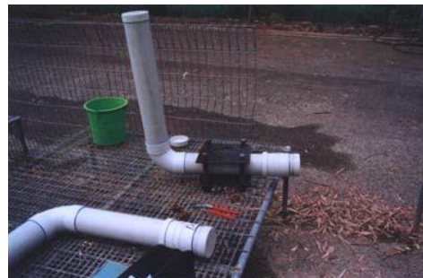
FIG.2 HORIZONTAL ASSEMBLIES. ONE WITH 7.5% DEFLECTION APPLIED TO THE SPIGOT VIA 2 PARALLEL STEEL PLATES