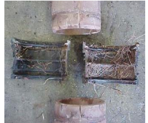
FIG. 14 VC PIPES JOINED WITH A PLASTICS COUPLING SHOWED A MASS OF ROOT INTRUSIONS WHEN DISSECTED.