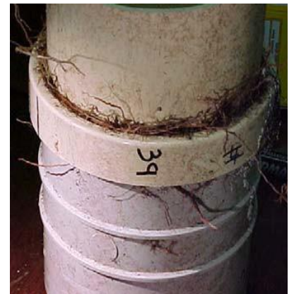
FIG. 11 MELALEUCA ROOTS GROWING IN THE CREVICES AT THE SOCKET OF A PVC JOINT