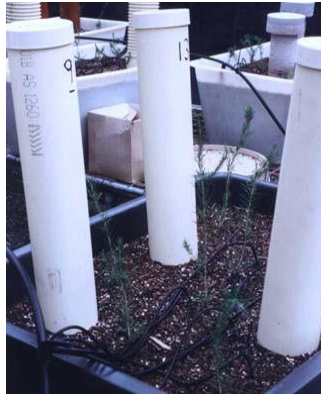
FIG. 4 HORIZONTAL ASSEMBLIES WITH MELALEUCA SEEDLINGS