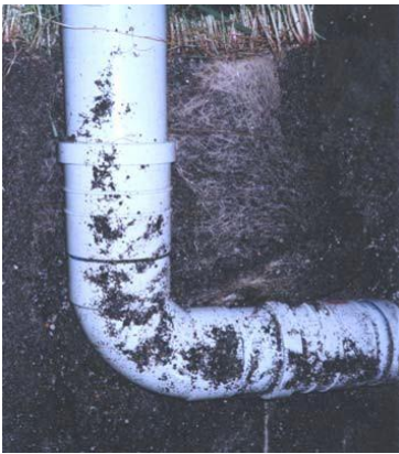
FIG. 6 RYE GRASS ROOTS BINDING ALL THE SOIL TOGETHER, INCLUDING THAT BELOW THE ASSEMBLY