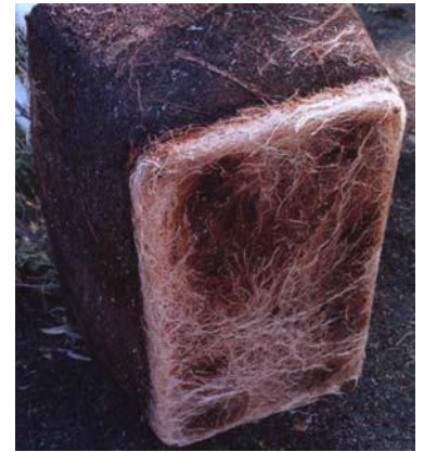
FIG. 8 MELALEUCA ROOTS BINDING ALL THE SOIL TOGETHER