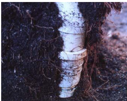
FIG. 9 MELALEUCA ROOTS SURROUNDING THE JOINT