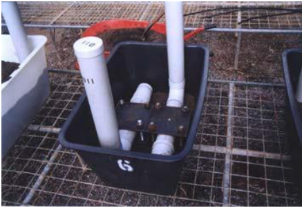
FIG. 3 TWO HORIZONTAL ASSEMBLIES WITH 7.5% DEFLECTION APPLIED AND READY FOR BURIAL